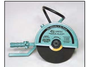
Cut-Off Saw with 14" abrasive blade